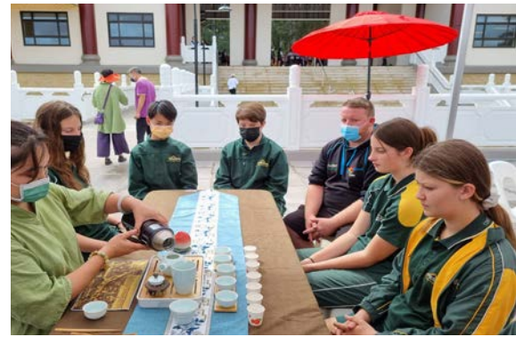
Enjoying learning about and participating in a Chinese Tea Ceremony

On the languages front, we happily recommenced our Chinese excursions with a fantastic trip to Brisbane to take part in Chung Tian Temple's Buddha's Birthday Celebrations. We joined seven other schools from Brisbane to participate in an action packed day which included: Lion Dancing; Chinese Art; Tea Ceremony; Chinese Diablo and Meditation. It was so much fun to be again enjoying learning in a different setting.