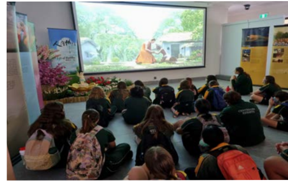
Focused on our welcoming film inside the newly opened section of Chung Tian Temple.

Designed to ease the transition to high school, this event will include the sharing of critical information as well as address individual queries.